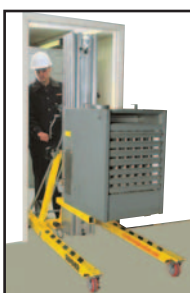
Fits through doorways!

Reversible Forks Using plunger pins, forks remove and reverse easily for added height or to get flush with a ceiling. No loose pieces!